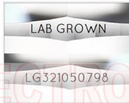
Girdle laser inscribed "LAB GROWN" and "LG321050798"

*Comments: This laboratory grown diamond was created by the CVD (Chemical Vapor Deposition) method, and has the same chemical, physical, and optical properties as a mined diamond. This diamond is Type IIa, which means it is devoid of nitrogen impurities.