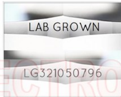
Girdle laser inscribed "LAB GROWN" and "LG321050796"

*Comments: This laboratory grown diamond was created by the CVD (Chemical Vapor Deposition) method, and has the same chemical, physical, and optical properties as a mined diamond. This diamond is Type IIa, which means it is devoid of nitrogen impurities.