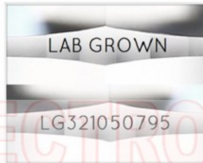
Girdle laser inscribed "LAB GROWN" and "LG321050795"

*Comments: This laboratory grown diamond was created by the CVD (Chemical Vapor Deposition) method, and has the same chemical, physical, and optical properties as a mined diamond. This diamond is Type IIa, which means it is devoid of nitrogen impurities.