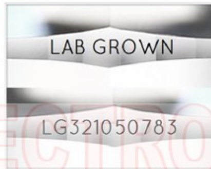
Girdle laser inscribed "LAB GROWN" and "LG321050783"

*Comments: This laboratory grown diamond was created by the CVD (Chemical Vapor Deposition) method, and has the same chemical, physical, and optical properties as a mined diamond. This diamond is Type IIa, which means it is devoid of nitrogen impurities.