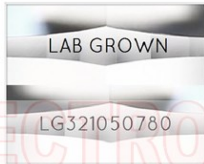
Girdle laser inscribed "LAB GROWN" and "LG321050780"

*Comments: This laboratory grown diamond was created by the CVD (Chemical Vapor Deposition) method, and has the same chemical, physical, and optical properties as a mined diamond. This diamond is Type IIa, which means it is devoid of nitrogen impurities.