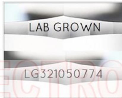
Girdle laser inscribed "LAB GROWN" and "LG321050774"

*Comments: This laboratory grown diamond was created by the CVD (Chemical Vapor Deposition) method, and has the same chemical, physical, and optical properties as a mined diamond. This diamond is Type IIa, which means it is devoid of nitrogen impurities.