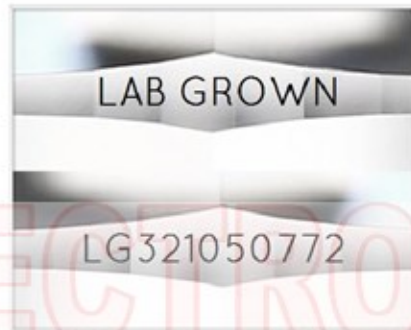
Girdle laser inscribed "LAB GROWN" and "LG321050772"

*Comments: This laboratory grown diamond was created by the CVD (Chemical Vapor Deposition) method, and has the same chemical, physical, and optical properties as a mined diamond. This diamond is Type IIa, which means it is devoid of nitrogen impurities.