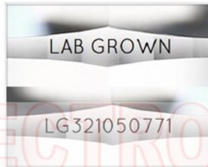
Girdle laser inscribed "LAB GROWN" and "LG321050771"

*Comments: This laboratory grown diamond was created by the CVD (Chemical Vapor Deposition) method, and has the same chemical, physical, and optical properties as a mined diamond. This diamond is Type IIa, which means it is devoid of nitrogen impurities.