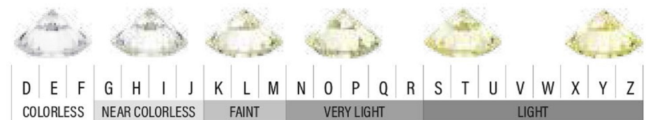
D - Z DIAMOND COLOR GRADING SCALE