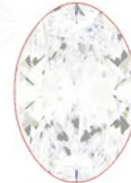
Optical Brilliance Excellent

Brilliance is the overall return of light to the viewer. The brilliance image is a representation of (a) white areas of light return, or brilliance, and (b) dark-blue areas of light loss.