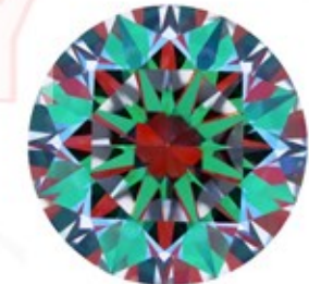
Optical Symmetry Excellent

The colored areas of the symmetry image are indications of light handling ability, giving a visual representation of proportions and facet alignment.