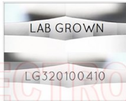
Girdle laser inscribed "LAB GROWN" and "LG320100410"

*Comments: This laboratory grown diamond was created by the CVD (Chemical Vapor Deposition) method, and has the same chemical, physical, and optical properties as a mined diamond. This diamond is Type IIa, which means it is devoid of nitrogen impurities.