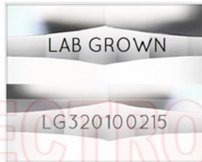
Girdle laser inscribed "LAB GROWN" and "LG320100215"

*Comments: This laboratory grown diamond was created by the CVD (Chemical Vapor Deposition) method, and has the same chemical, physical, and optical properties as a mined diamond. This diamond is Type IIa, which means it is devoid of nitrogen impurities.