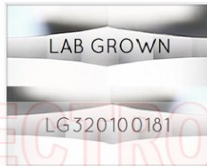
Girdle laser inscribed "LAB GROWN" and "LG320100181"

*Comments: This laboratory grown diamond was created by the CVD (Chemical Vapor Deposition) method, and has the same chemical, physical, and optical properties as a mined diamond. This diamond is Type IIa, which means it is devoid of nitrogen impurities.