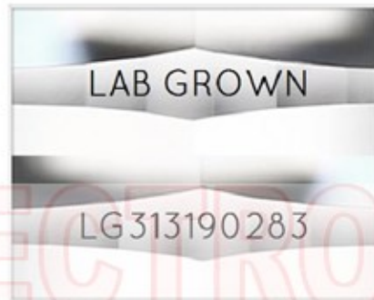
Girdle laser inscribed "LAB GROWN" and "LG313190283"

*Comments: This laboratory grown diamond was created by the CVD (Chemical Vapor Deposition) method, and has the same chemical, physical, and optical properties as a mined diamond. This diamond is Type IIa, which means it is devoid of nitrogen impurities.