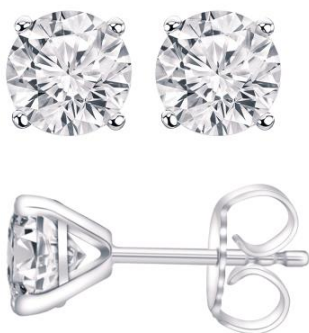
Photo of jewelry style, not actual size

Lab Grown Diamond Solitaire Stud Earrings with a Total Weight of 1.28 ct(s)