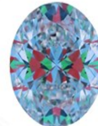
Optical Symmetry Very Good

The colored areas of the symmetry image are indications of light handling ability, giving a visual representation of proportions and facet alignment.