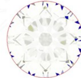
Optical Brilliance Excellent

Brilliance is the overall return of light to the viewer. The brilliance image is a representation of (a) white areas of light return, or brilliance, and (b) dark-blue areas of light loss.