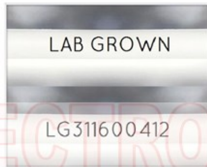
Girdle laser inscribed "LAB GROWN" and "LG311600412"

*Comments: This man-made diamond was grown in a laboratory by the HPHT method, and has the same chemical, physical, and optical properties as a natural earth mined diamond.