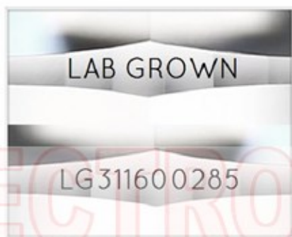
Girdle laser inscribed "LAB GROWN" and "LG311600285"

*Comments: This man-made diamond was grown in a laboratory by the HPHT method, and has the same chemical, physical, and optical properties as a natural earth mined diamond.