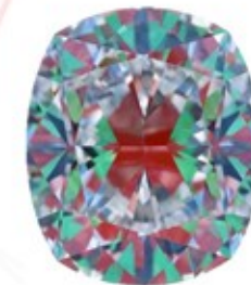
Optical Symmetry Excellent

The colored areas of the symmetry image are indications of light handling ability, giving a visual representation of proportions and facet alignment.