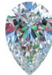
Optical Symmetry Good

The colored areas of the symmetry image are indications of light handling ability, giving a visual representation of proportions and facet alignment.