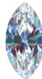
Optical Symmetry Very Good

The colored areas of the symmetry image are indications of light handling ability, giving a visual representation of proportions and facet alignment.