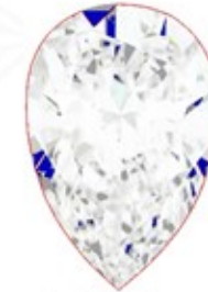
Optical Brilliance Excellent

Brilliance is the overall return of light to the viewer. The brilliance image is a representation of (a) white areas of light return, or brilliance, and (b) dark-blue areas of light loss.