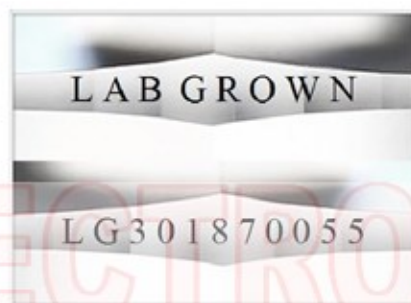
Girdle laser inscribed "LAB GROWN" and "LG301870055"

*Comments: This man-made diamond was grown in a laboratory by the HPHT method, and has the same chemical, physical, and optical properties as a natural earth mined diamond.