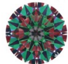
Optical Symmetry Excellent