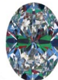
Optical Symmetry Very Good

The colored areas of the symmetry image are indications of light handling ability, giving a visual representation of proportions and facet alignment.