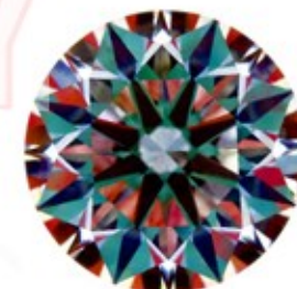
Optical Symmetry Excellent

The colored areas of the symmetry image are indications of light handling ability, giving a visual representation of proportions and facet alignment.