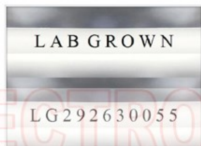
Girdle laser inscribed "LAB GROWN" and "LG292630055"

*Comments: This man-made diamond was grown in a laboratory by the HPHT method, and has the same chemical, physical, and optical properties as a natural earth mined diamond.