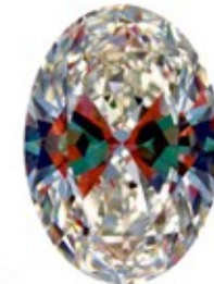
Optical Symmetry Very Good

The colored areas of the symmetry image are indications of light handling ability, giving a visual representation of proportions and facet alignment.