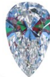
Optical Symmetry Good

The colored areas of the symmetry image are indications of light handling ability, giving a visual representation of proportions and facet alignment.