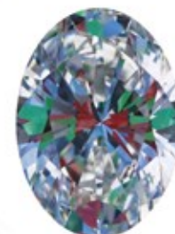
Optical Symmetry Very Good

The colored areas of the symmetry image are indications of light handling ability, giving a visual representation of proportions and facet alignment.