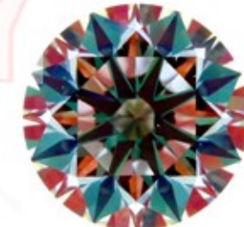
Optical Symmetry Excellent

The colored areas of the symmetry image are indications of light handling ability, giving a visual representation of proportions and facet alignment.