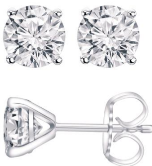
Photo of jewelry style, not actual size

Lab Grown Diamond Solitaire Stud Earrings with a Total Weight of 1.22 ct(s)