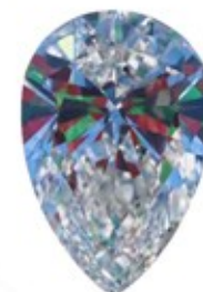
Optical Symmetry Good

The colored areas of the symmetry image are indications of light handling ability, giving a visual representation of proportions and facet alignment.