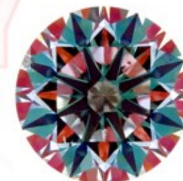
Optical Symmetry Excellent

The colored areas of the symmetry image are indications of light handling ability, giving a visual representation of proportions and facet alignment.