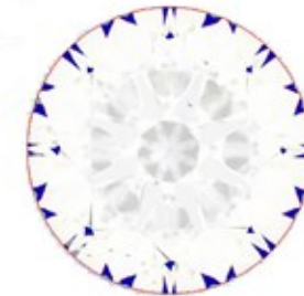
Optical Brilliance Excellent

Brilliance is the overall return of light to the viewer. The brilliance image is a representation of (a) white areas of light return, or brilliance, and (b) dark-blue areas of light loss.