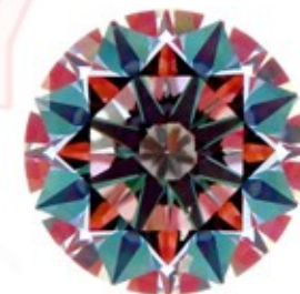
Optical Symmetry Excellent

The colored areas of the symmetry image are indications of light handling ability, giving a visual representation of proportions and facet alignment.