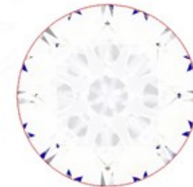
Optical Brilliance Excellent

Brilliance is the overall return of light to the viewer. The brilliance image is a representation of (a) white areas of light return, or brilliance, and (b) dark-blue areas of light loss.