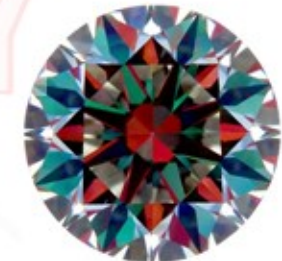
Optical Symmetry Excellent

The colored areas of the symmetry image are indications of light handling ability, giving a visual representation of proportions and facet alignment.