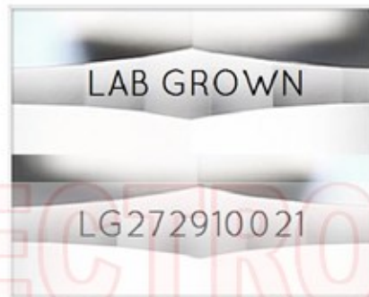
Girdle laser inscribed "LAB GROWN" and "LG272910021"

*Comments: This laboratory grown diamond was created by the CVD (Chemical Vapor Deposition) method, and has the same chemical, physical, and optical properties as a mined diamond. This diamond is Type IIa, which means it is devoid of nitrogen impurities.