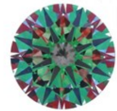
Optical Symmetry Excellent