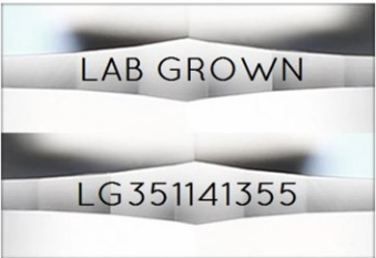
Illustration depicts approx. girdle appearance