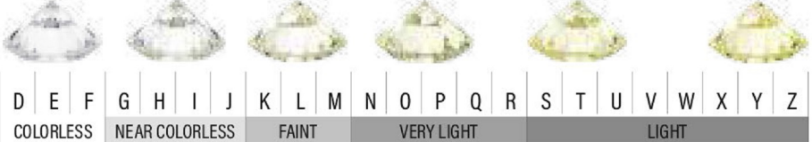
D - Z DIAMOND COLOR GRADING SCALE