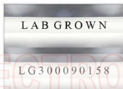
Girdle laser inscribed "LAB GROWN" and "LG300090158"

*Comments: This man-made diamond was grown in a laboratory by the HPHT method, and has the same chemical, physical, and optical properties as a natural earth mined diamond.