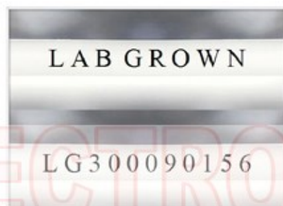
Girdle laser inscribed "LAB GROWN" and "LG300090156"

*Comments: This man-made diamond was grown in a laboratory by the HPHT method, and has the same chemical, physical, and optical properties as a natural earth mined diamond.