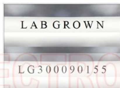
Girdle laser inscribed "LAB GROWN" and "LG300090155"

*Comments: This man-made diamond was grown in a laboratory by the HPHT method, and has the same chemical, physical, and optical properties as a natural earth mined diamond.