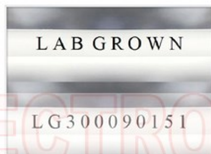
Girdle laser inscribed "LAB GROWN" and "LG300090151"

*Comments: This man-made diamond was grown in a laboratory by the HPHT method, and has the same chemical, physical, and optical properties as a natural earth mined diamond.