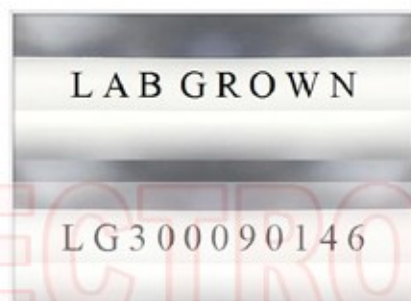
Girdle laser inscribed "LAB GROWN" and "LG300090146"

*Comments: This man-made diamond was grown in a laboratory by the HPHT method, and has the same chemical, physical, and optical properties as a natural earth mined diamond.