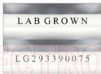
Girdle laser inscribed "LAB GROWN" and "LG293390075"

*Comments: This man-made diamond was grown in a laboratory by the HPHT method, and has the same chemical, physical, and optical properties as a natural earth mined diamond.